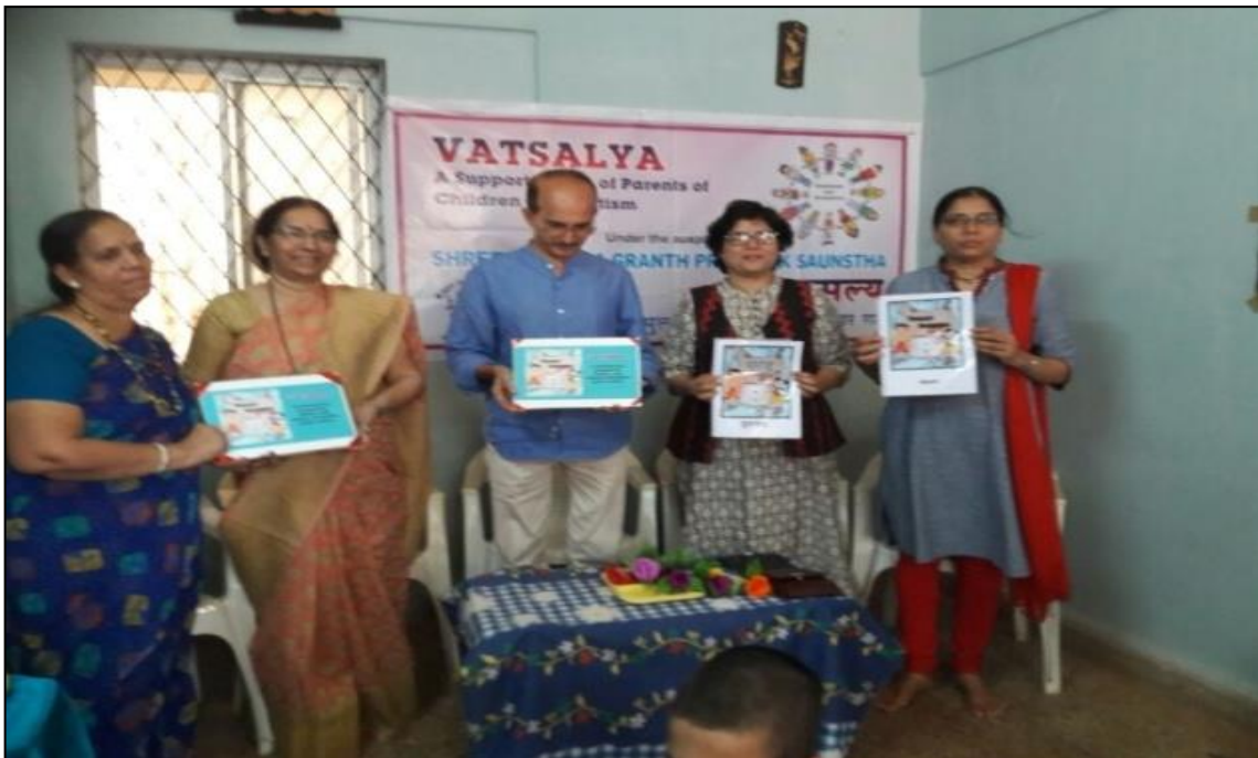
Android App Inauguration