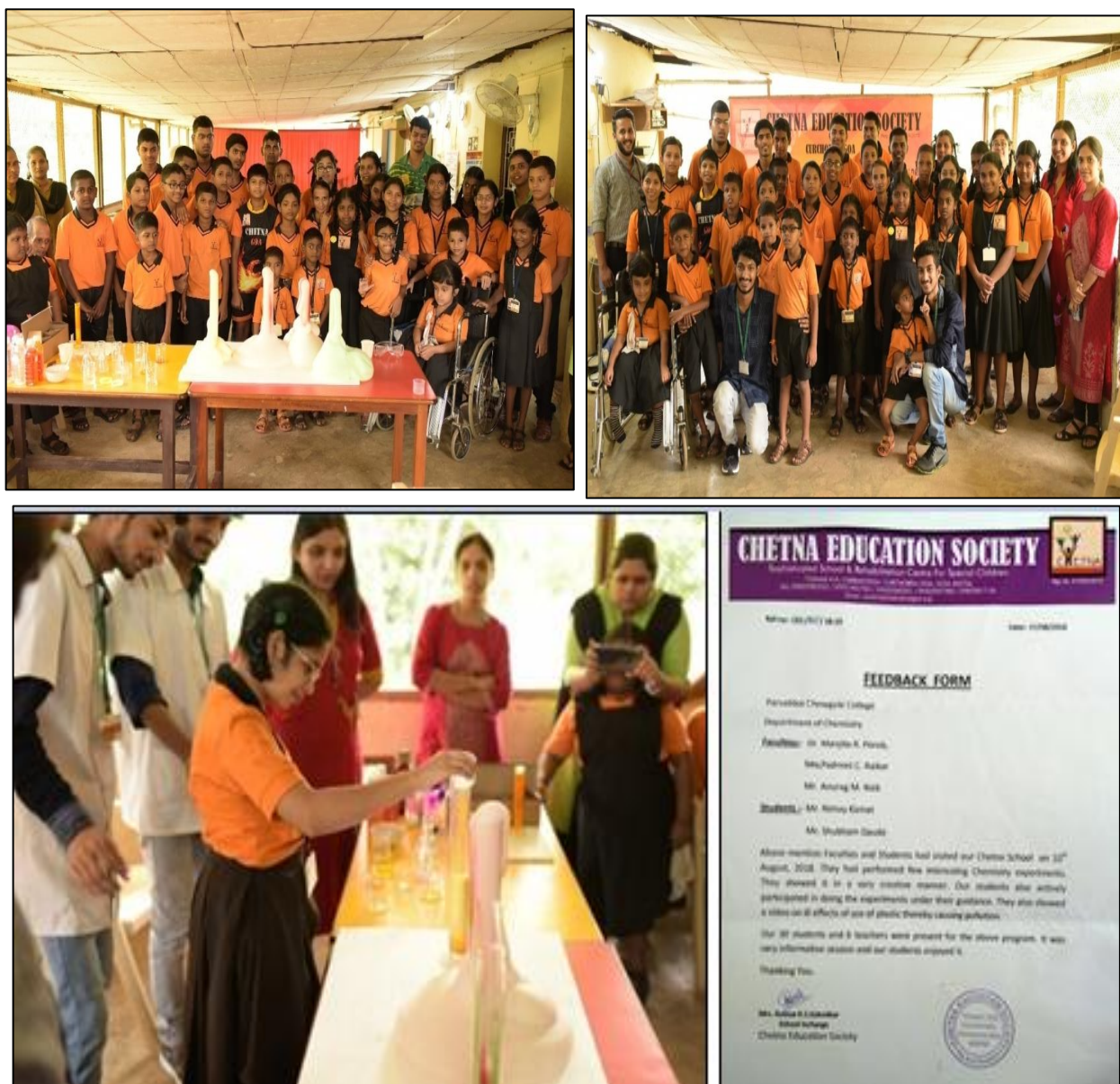
A student from Chetana Educational trust's School cum rehabilitation centre, Curchorem Goa performing experiment at the workshop on 'Fun with Chemistry'