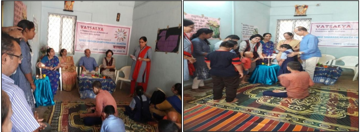
Students from Chetana Educational trust's School cum rehabilitation centre, Curchorem Goa displaying at the workshop on 'Fun with Chemistry'