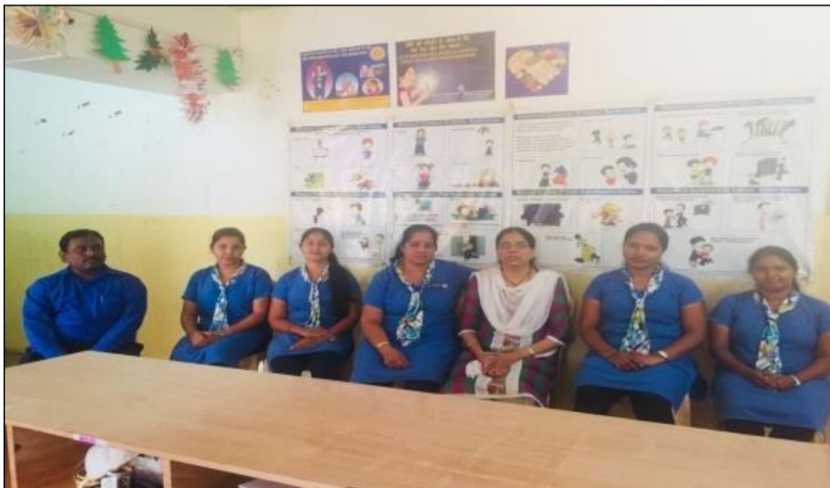
Students from Chetana Educational trust's School cum rehabilitation center with the models at workshop

Beneficiaries / target group: Children with autism